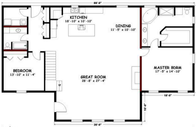
2 nd Story